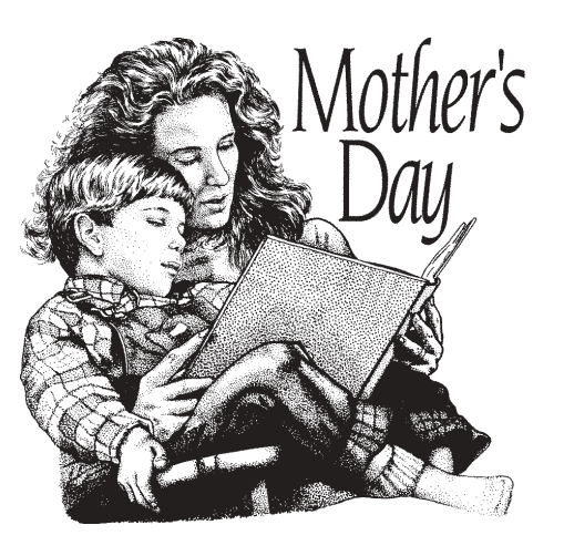
Remember...Mother's Day is Sunday, May 13!!!!!!